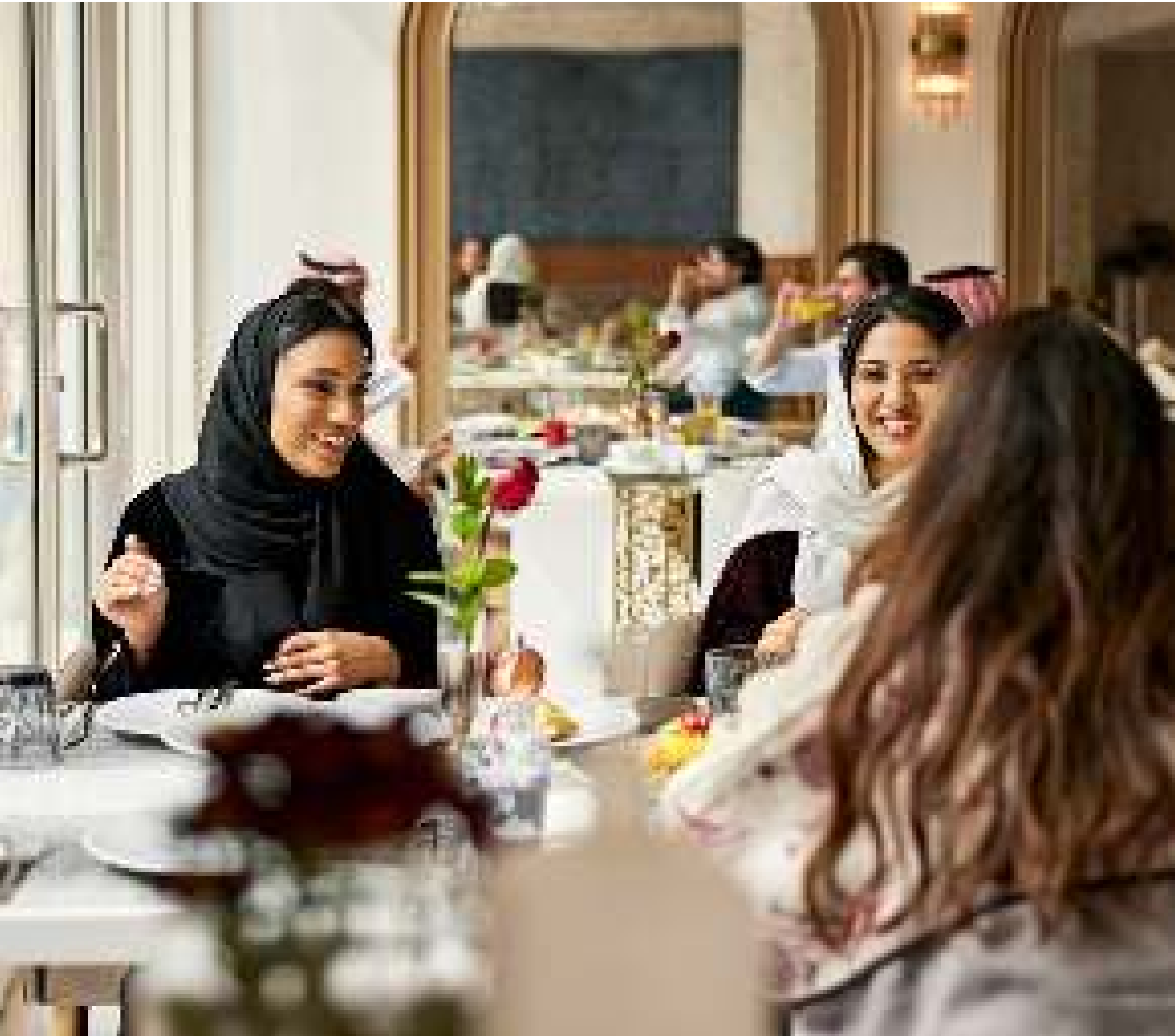
Retail & Dining