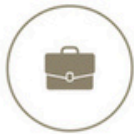
FOUNDER AND CHAIRMAN, SOBHA GROUP